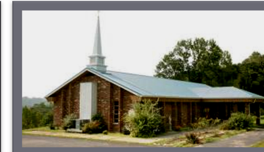
Holy Redeemer 120 Industrial Drive Greensburg