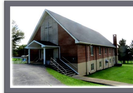
Good Shepherd 1217 Greensburg Street Columbia