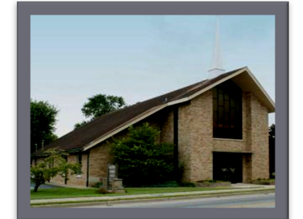
Holy Spirit 406 N Main Street Jamestown

Mailing Address for all Churches — PO Box 247 Jamestown, KY 42629