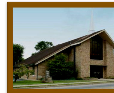
Holy Spirit 406 N Main Street Jamestown

Mailing Address for all Churches — PO Box 247 Jamestown, KY 42629