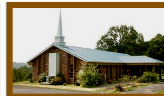
Holy Redeemer 120 Industrial Drive Greensburg