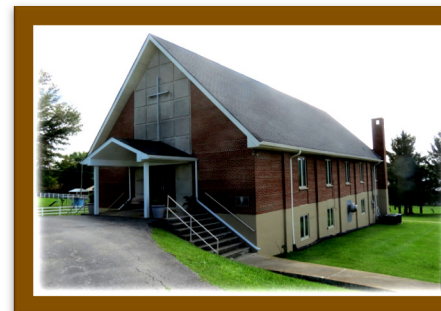
Good Shepherd 1217 Greensburg Street Columbia