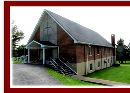
Good Shepherd 1217 Greensburg Street Columbia