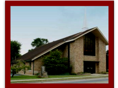
Holy Spirit 406 N Main Street Jamestown

Mailing Address for all Churches — PO Box 247 Jamestown, KY 42629