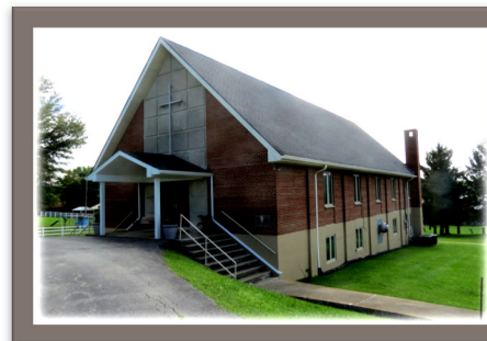
Good Shepherd 1217 Greensburg Street Columbia